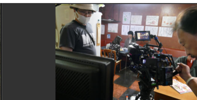
The last day shooting in Japan on October 21th

1) Staff and cast travel expenses (12 people / round trip between Tokyo and Paris): 9399.07 Euros