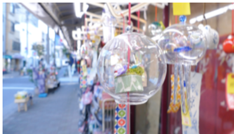
wind bells from the shooting in Tokyo / October 2020

<Reference> "Best 10 in 2018" of the most traditional movie magazine "Kinema Junpo" in Japan was selected by 60 judges. Our film "Charlotte Susabi" was watched by only five among sixty judges because of being an independent small film. However three of them nominated for the top ten. One critic nominated as second after Hirokazu Koreeda's "Shoplifters / Une affaire de famille"