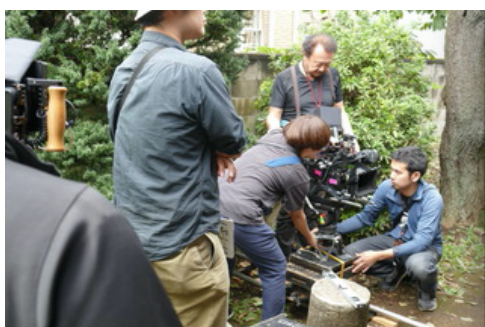
The first day shooting in Japan_October 15 th 2019

<Filming schedule> First shooting was held for 6 days in Japan from October 15 to 21, 2019. An additional week will be scheduled in June 2020 in South Normandy in France, and three days in Nyon - Switzerland.